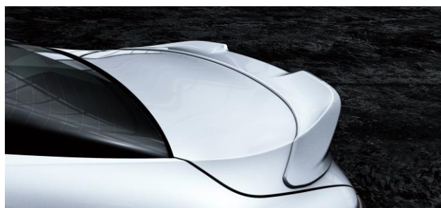
GR Rear Trunk Spoiler