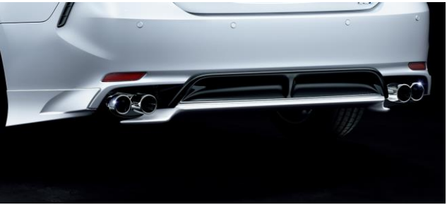
GR Rear Bumper Spoiler