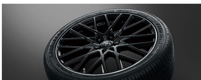
19inch Alloy Wheel