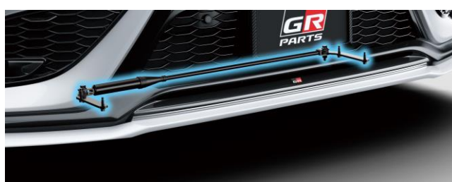
GR Performance Damper®