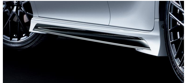
GR Side Skirts