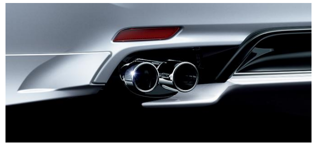
GR Dress Up Muffler