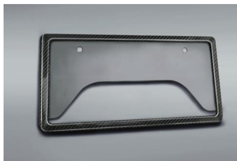
GR Carbon Number Frame

* Performance Damper® is registered trademarks of Yamaha Motor Co., Ltd.