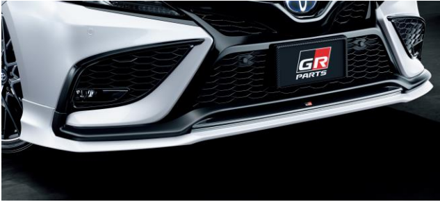
GR Front Spoiler