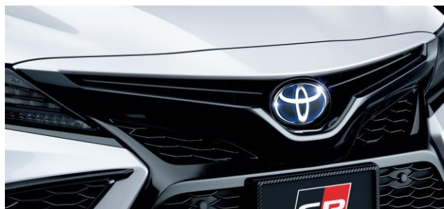
GR Front Bumper Garnish