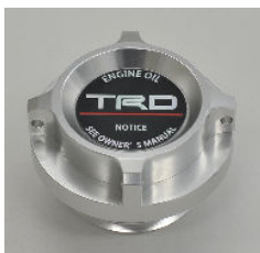
Oil Filler Cap