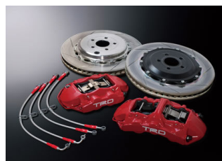
Mono Block Brake Kit