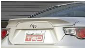
Rear Trunk Spoiler