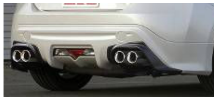
Rear Bumper Spoiler