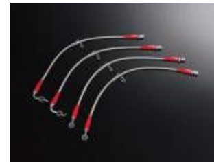
Direct Brake Line (for Genuine Caliper)